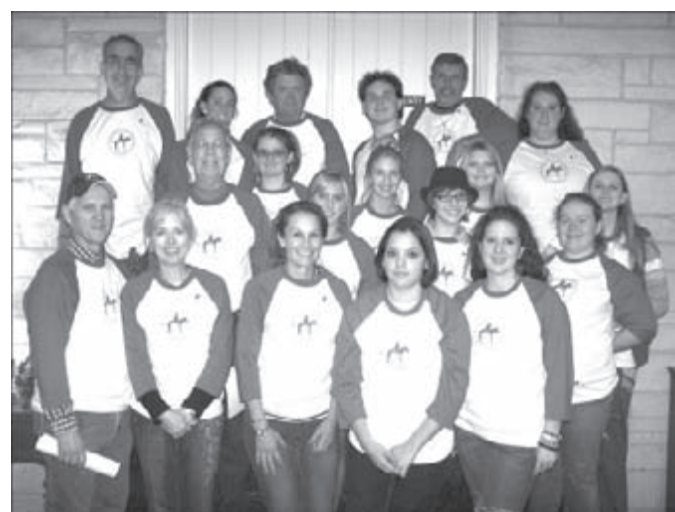
Members of the U.M. ARMY

The FUMC members themselves started each day with worship before getting to work at the shelter. Some days there would be swimming at a nearby fitness center; the group even had dinner at the Rainforest Café restaurant one night during the week. They also had a candlelight