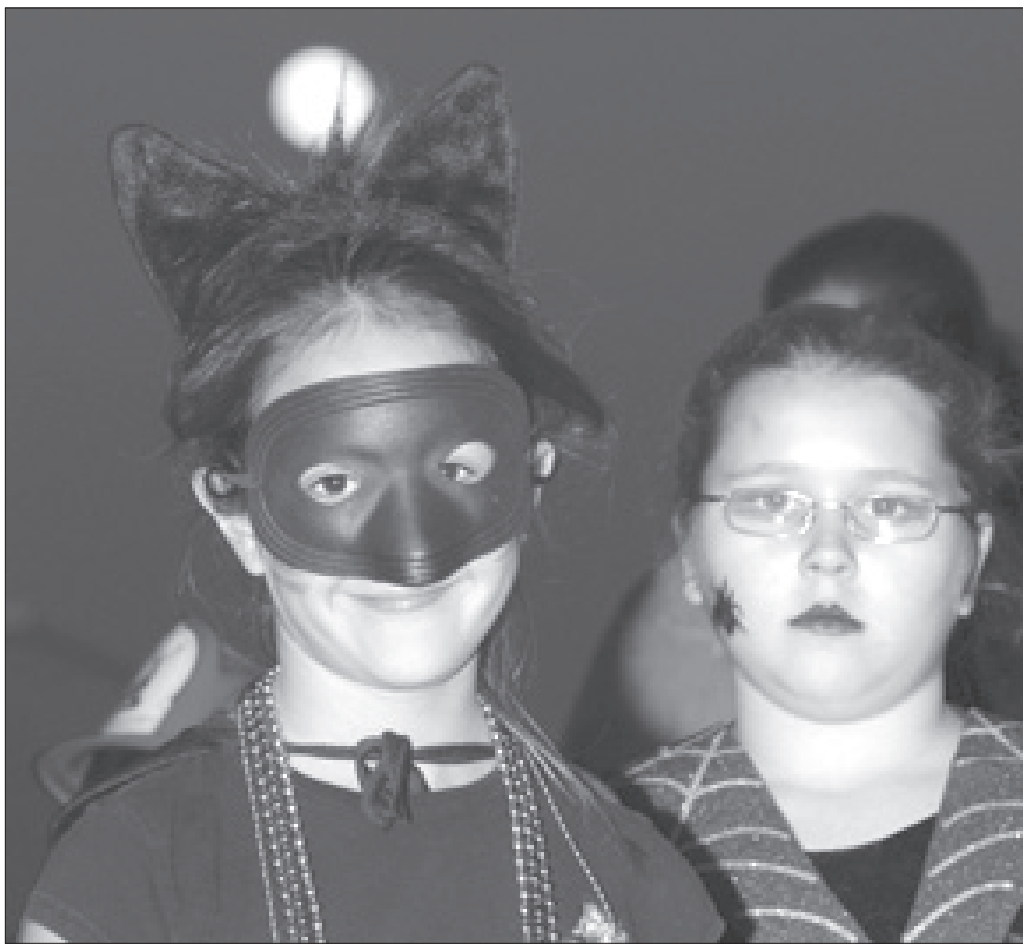
Scenes from previous Halloween at the Hatchery events