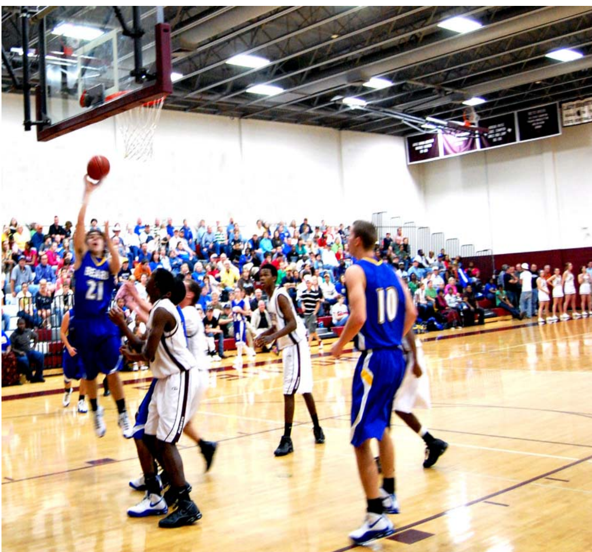
Brownsboro fell to Fairfield in Jan. 30th road games, as the Freestone County school took victory in both the boys and girls varsity games over the Bears.

The Bearettes fell behind by 10 after the first period of play, then played the Lady