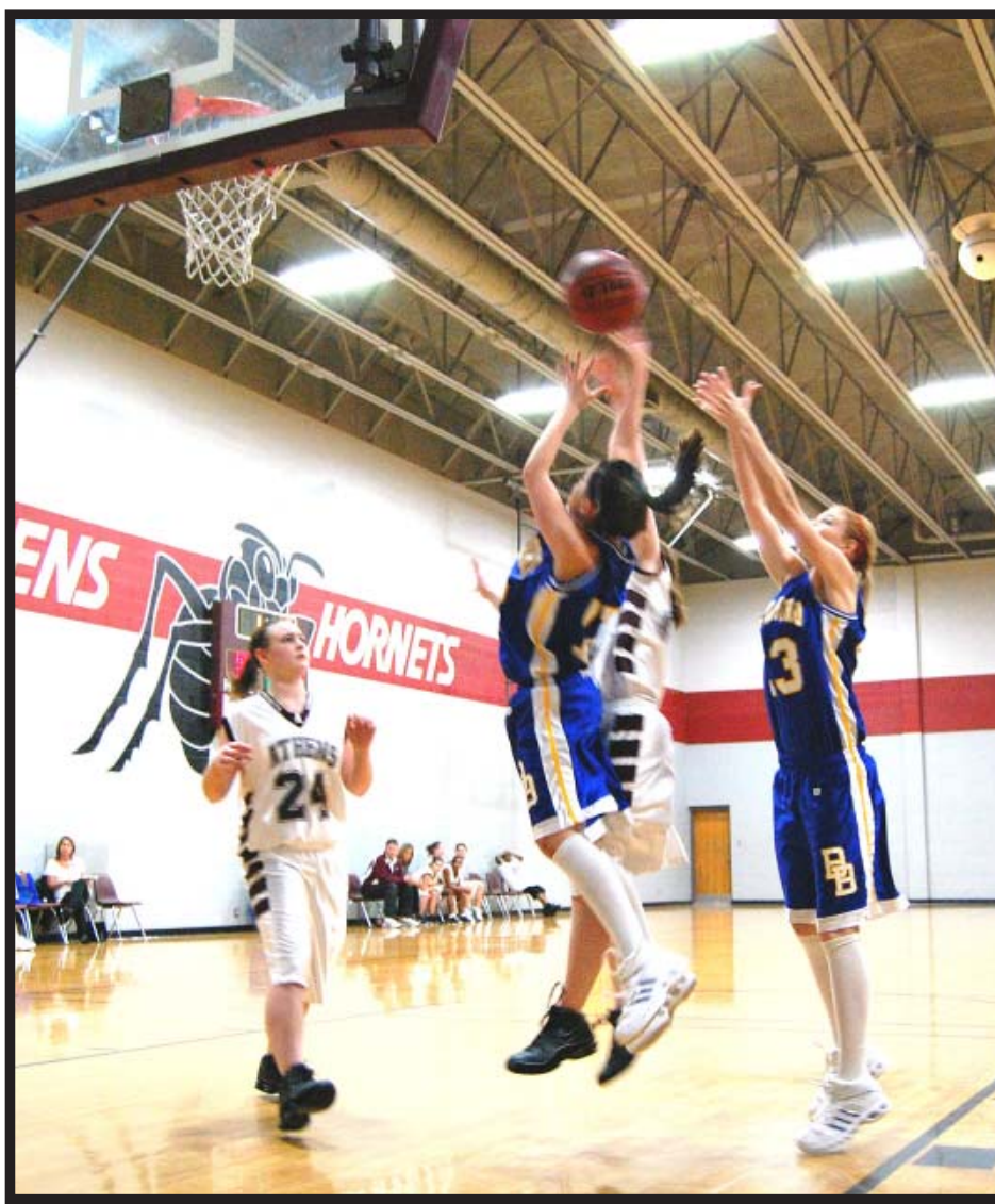
The Bearettes fought through a slow middle section of their contest against Fairfield on Jan. 30th, but were unable to overcome the soft spell in the end. They fell to the Lady Eagles, 60-45, in a game played on the road in Fairfield. The Bearettes are set for a district road game with the Crockett Lady Bulldogs on Friday.